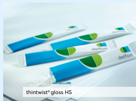
thintwist® gloss HS