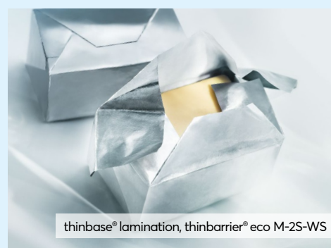
thinbase® lamination, thinbarrier® eco M-2S-WS