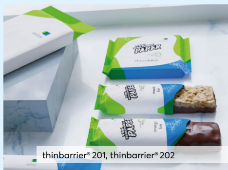
thinbarrier® 201, thinbarrier® 202

Flexible packaging for food plays a decisive role in our modern lifestyle. It is our ambition to reinvent paper by finding the right balance between required functionality and waste reduction of the paper packaging. We do this by optimizing paper properties, reducing material use and using renewable fibers. Our low grammage papers offer outstanding mechanical strength leading to potential basis weight reductions, and thereby having a yield advantage. Our wide range of high-density food packaging papers serves as a solution for barrier paper packaging (e.g., confectionery, frozen food), base paper for dry food bags, confectionery wrapping, pouches, and various laminates.